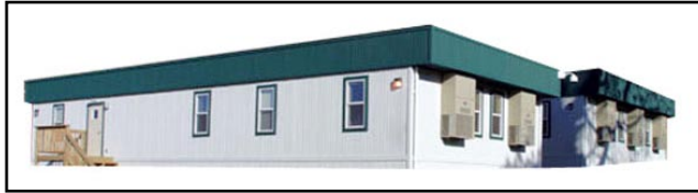
Sample Exterior. Refer to Plan for Building Size & Layout.