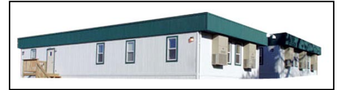
Sample Exterior. Refer to Plan for Building Size & Layout.