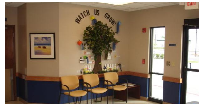
LOBBY / RECEPTION / PATIENT WAITING AREA (HEARNE, TX)