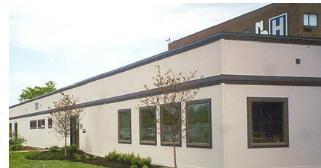
EXTERIOR VIEW OF A DIALYSIS EXPANSION TO A HOSPITAL (NORTH PENN HOSPITAL)