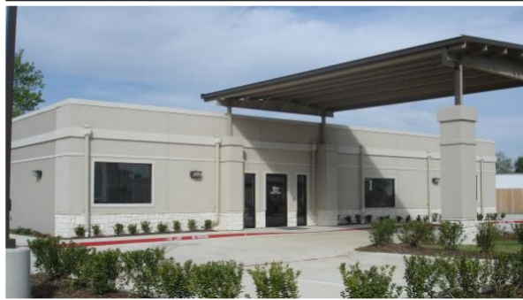
EXTERIOR OF FREESTANDING DIALYSIS CLINIC (HEARNE, TEXAS)

Our previous dialysis projects have received recognition with Awards of Distinction from the Modular Building Institute and our clientele includes numerous repeat customers.