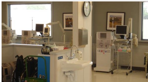
INTERIOR VIEW OF DIALYSIS TREATMENT AREA (HEARNE, TX)