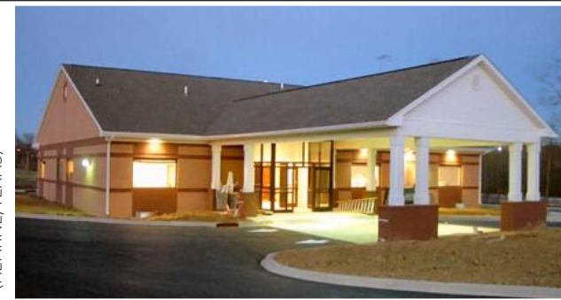
EXTERIOR OF FREESTANDING DIALYSIS CLINIC (LAGRANGE, KY)