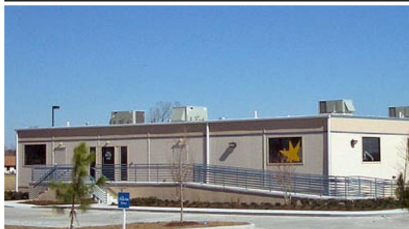
EXTERIOR OF FREESTANDING DIALYSIS CLINIC (LA PLACE, LA)