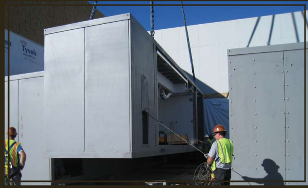
MULTI-UNIT ENCLOSURES INSTALLED ON SITE