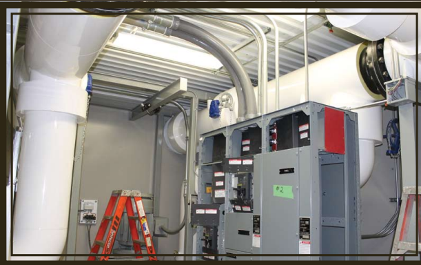
EQUIPMENT INSTALLED & TESTED